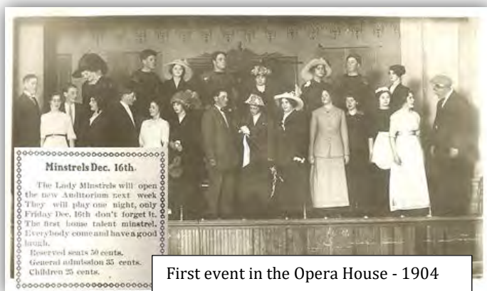
First event in the Opera House - 1904