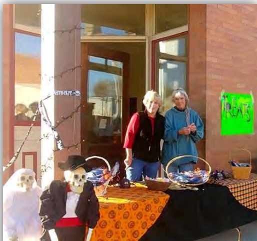
Harrington Community Halloween Activities