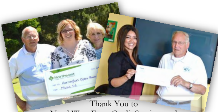
Thank You to NorthWest Farm Credit Services and US Bank for Grant Support in 2017