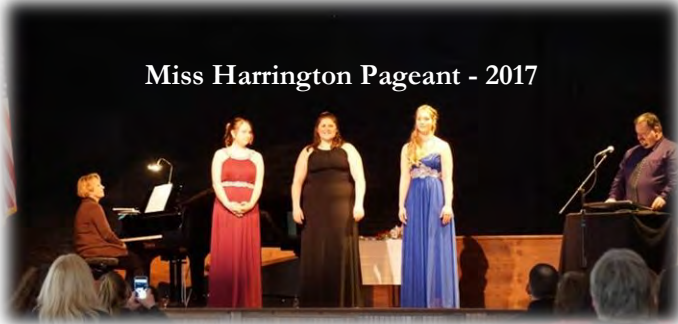
Miss Harrington Pageant - 2017