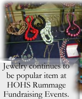
Jewelry continues to be popular item at HOHS Rummage Fundraising Events.