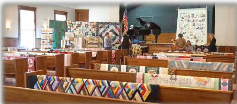
Cruizin' Harrington Quilt Show – May 2017