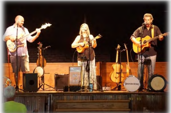
Bridges Home returned to the HOH in August, 2017