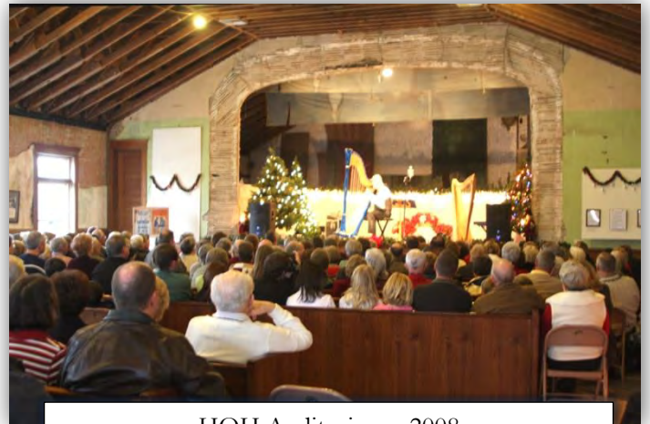
HOH Auditorium - 2008